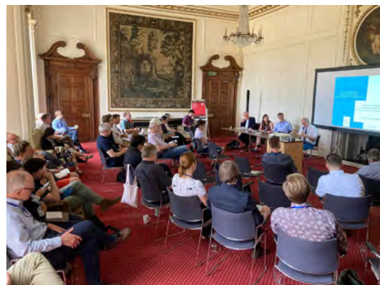
Bach Dialogue Meeting 2022