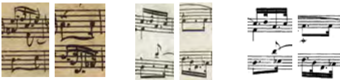
Ex.1: Bach's autograph (1739)

rhythmic notation somewhat incorrectly. Modern editions such as Wiener Urtext (1983) and Bärenreiter (1996) align the notes still incorrectly but inform their readers with supplementary comments that the notes \text{♪♪} are to be rendered \text{♪♪♪} when played in conjunction with figures such as \text{♪♪♪♪} . (Incidentally, the Henle edition (2007) aligns the notes correctly as the Simrock does.)