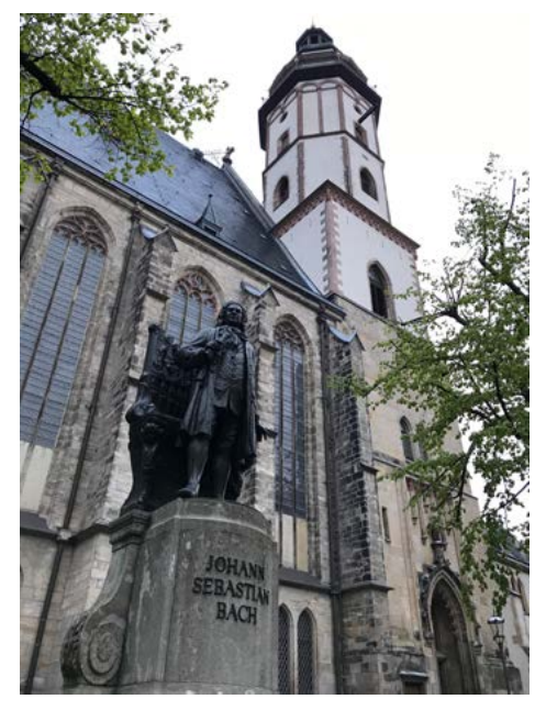
The Bach statue in front of the Thomaskirche

Bachfest Leipzig 2019 will run from June 14 to 23 with the motto "Bach, Court Compositeur." For further information, visit <u>https://www.bachfestleipzig.de/en/bachfest</u>