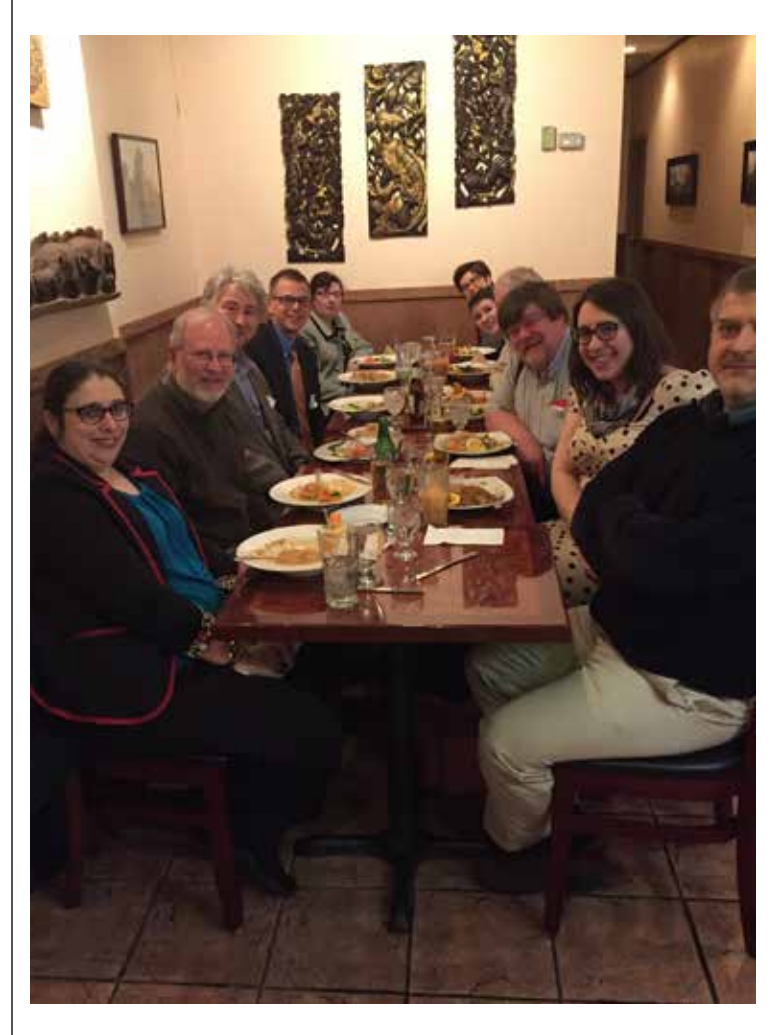
Conference participants gather for dinner