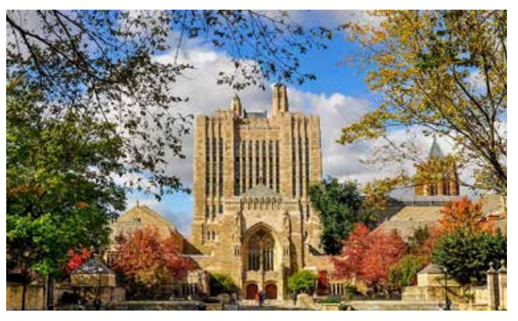
Cross Campus, Yale University