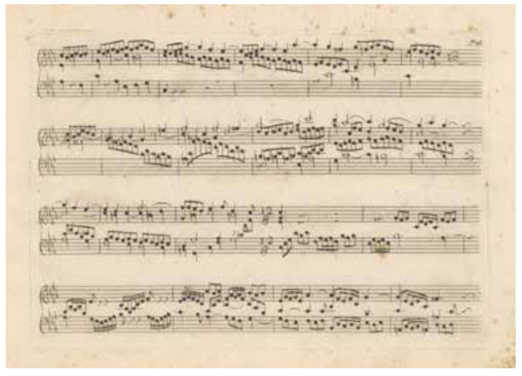
Beginning of the 12/8 section of the Fugue in E-flat Major, BWV 552/2 (D-LEb, Peters PM 1403)

My own introduction to Bach was through the "St. Anne" fugue for organ (BWV 552/2), when I was probably 11 years old. I was turning pages and pulling stops for my father who was organist at St. Stephen's Episcopal Church in Durham, NC and a math professor at Duke. Looking at the notes on the page, hearing the organ sound (a magnificent three-manual Flentrop), the Bach dynamo of intervals and rhythms started to churn. I remember distinctly my feeling at the moment in the "St. Anne" where the music turns the corner into 12/8 for the final section. I always felt this kind of super-charging, and by the time the slow theme was woven underneath, the feeling was irresistible awe. Over the years, my experience of this music has not changed one bit.