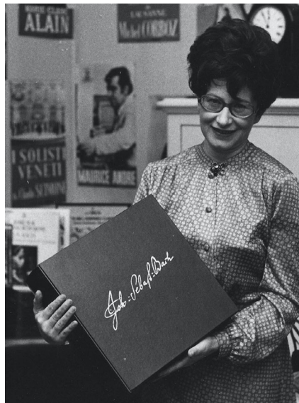
Zuzana Růžicková, 1975 on ERATO's release of her recordings of the Complete Bach Keyboard Works

[Editor's Note: Word of Prof. Růžicková's recent death reached us as this newsletter was in press. Our sincere condolences go out to the family. Here is a link to the obituary in The New York Times : https://www.nytimes.com/2017/10/03/obituaries/zuzana-ruzickova-dead-leading-harpsichordist-and-war-survivor.html ]