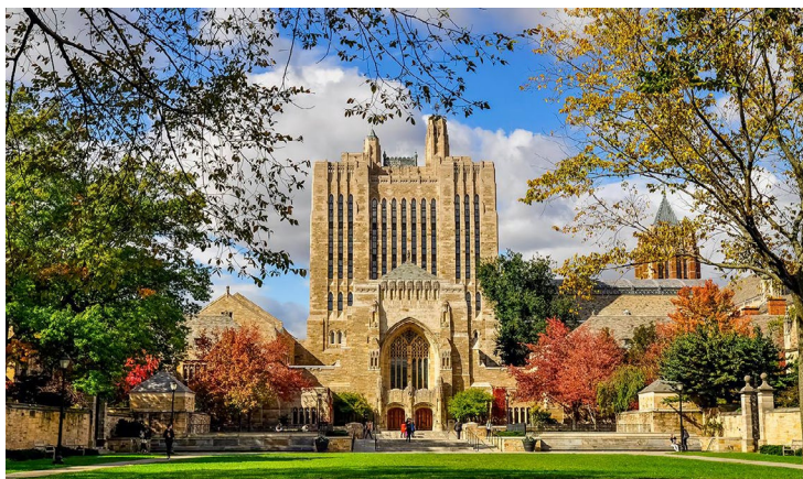
Cross Campus, Yale University