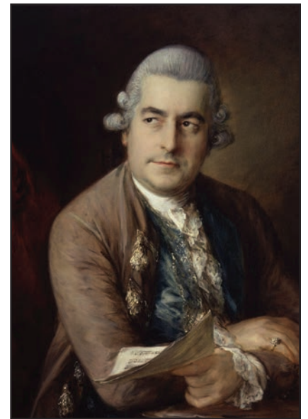
Johann Christian Bach (Thomas Gainsborough, 1776)