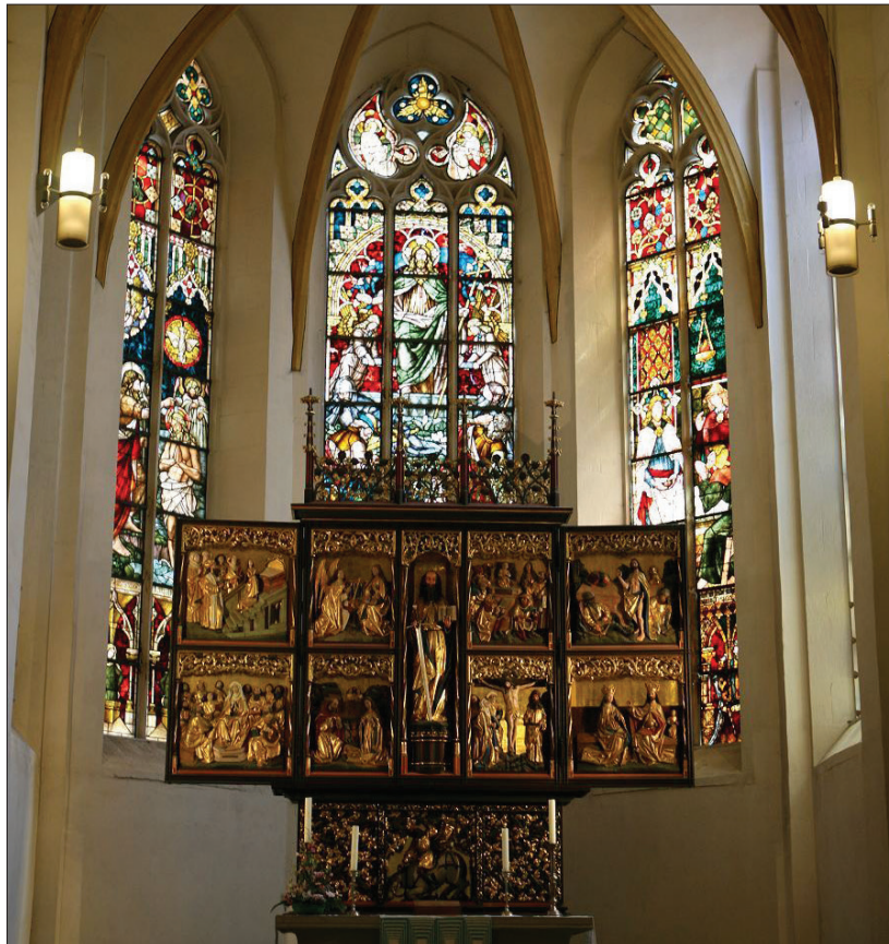
Paulusaltar in the St. Thomas Church