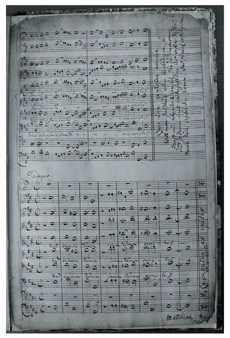
Figure 2.3. Autograph score to Mattheson's Magnificat: last page, which contains the date, transitional adagio, and comments concerning the repetition of the opening chorus.

Markuspassion," Bach-Jahrbuch 85 (1999): 35-50.