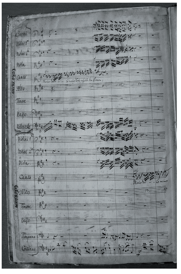
Figures 2.1 and 2.2. Autograph score to Mattheson's Magnificat: first two pages of the opening double chorus.

here, that Bach, having discovered the paraphrased text among printed librettos from the Hamburg Cathedral, is the composer of the work after all.